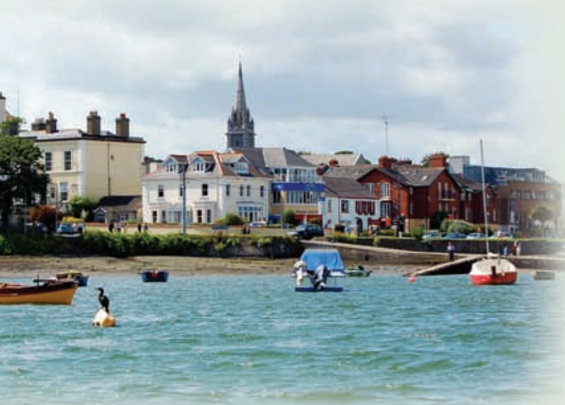
Malahide, a perfect Dublin Coastal Location (10 minutes from Dublin Airport, 20 minutes from Dublin city centre)

In addition to offering tuition, we encourage students to socialize together and to visit places of cultural interest. We organize social nights and also school tours.