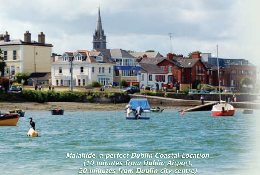
Malahide, a perfect Dublin Coastal Location (10 minutes from Dublin Airport, 20 minutes from Dublin city centre)