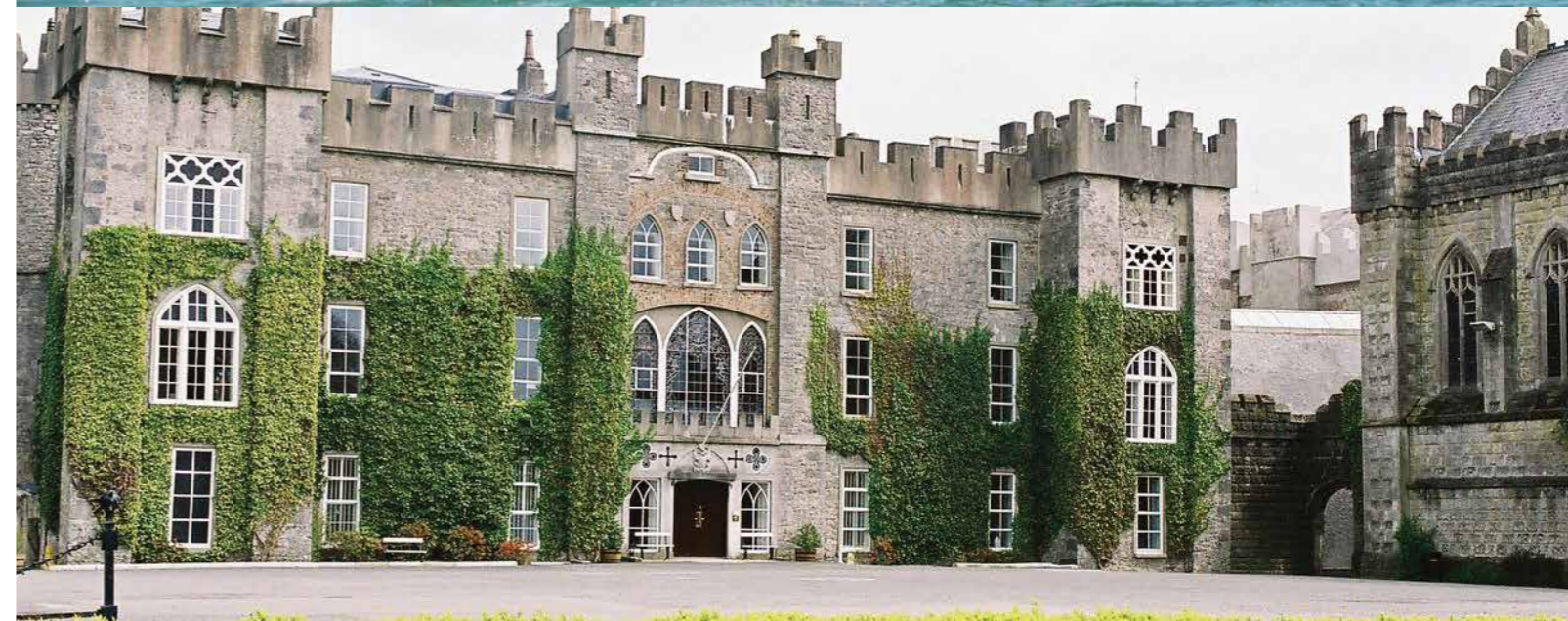
Clongowes Wood College