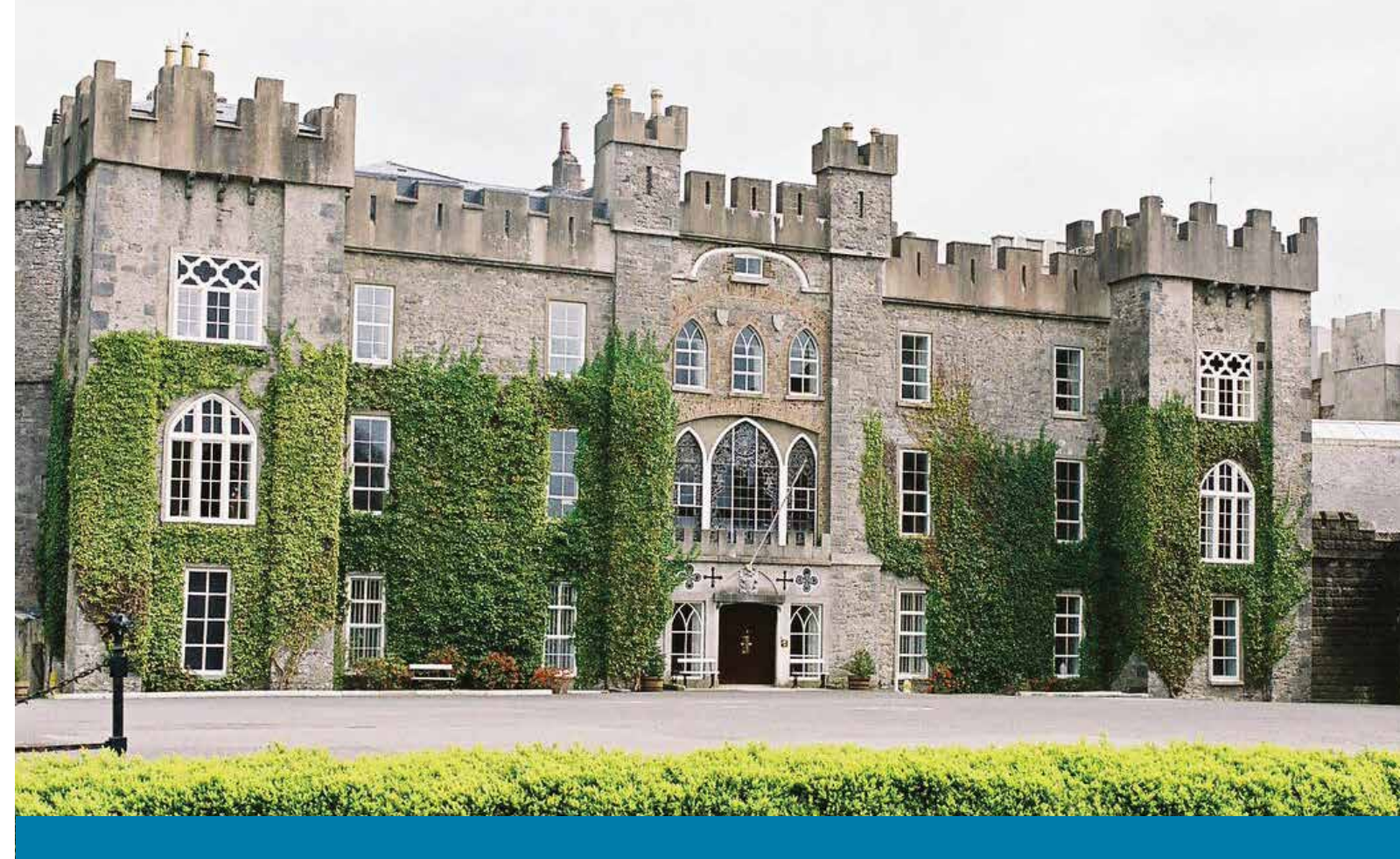
Ireland's most famous boarding school Established 1814

As part of our continuous efforts to maintain high quality classes and to enhance our student's intercultural experience, we have weekly lessons called the Intercultural Teenage Programme. Irish, teenage students will join lessons to lead an exercise alongside teacher which allows our students the opportunity to connect with Irish teenagers, their peers and we have had an incredibly positive response to this programme.